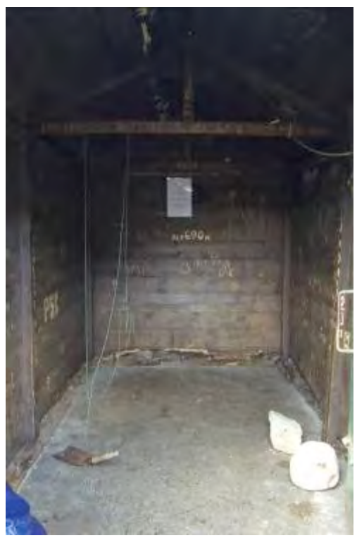
Figure 3- Internal view