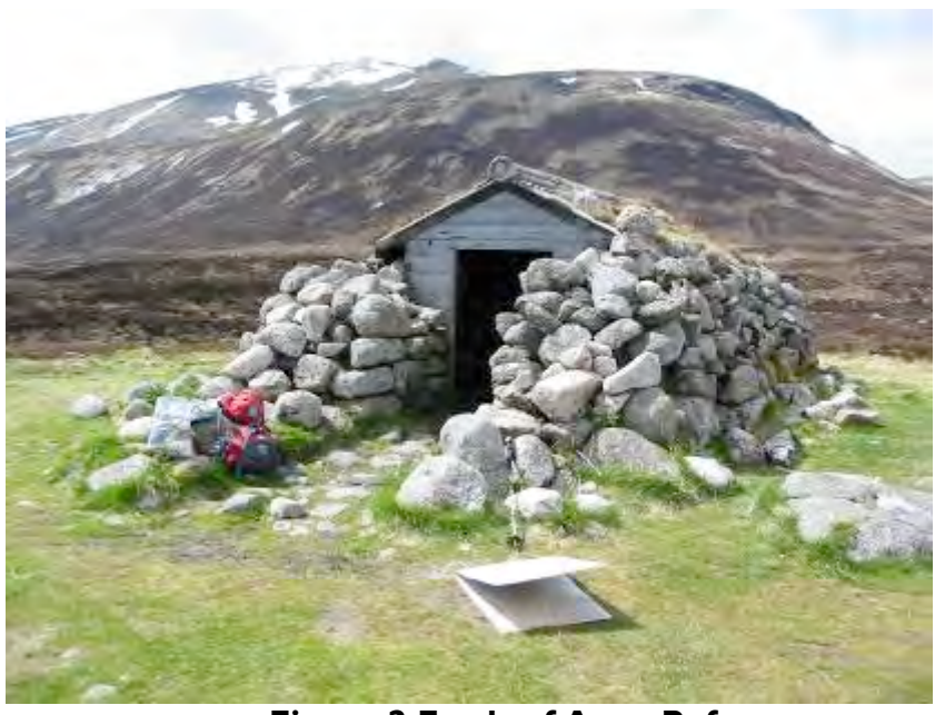
Figure-2 Fords of Avon Refuge